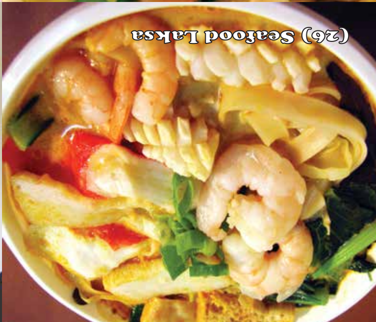
(26) Seafood Laksa