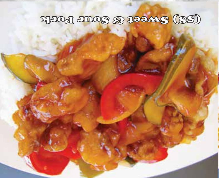
(58) Sweet & Sour Pork