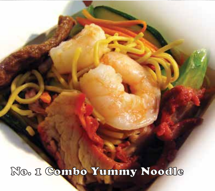
No. 1 Combo Yummy Noodle