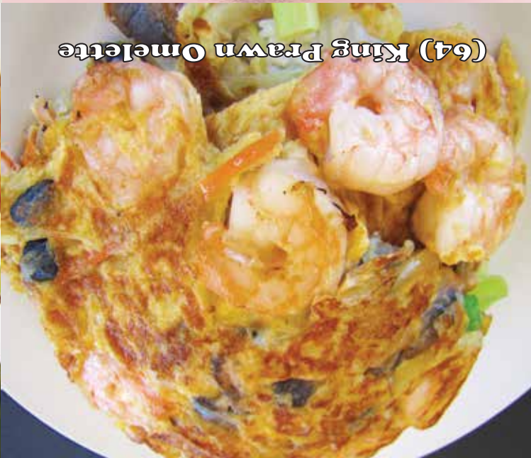
(64) King Prawn Omelette