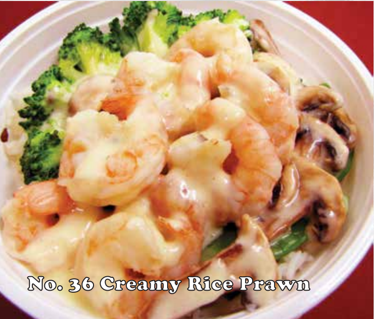
No. 36 Creamy Rice Prawn