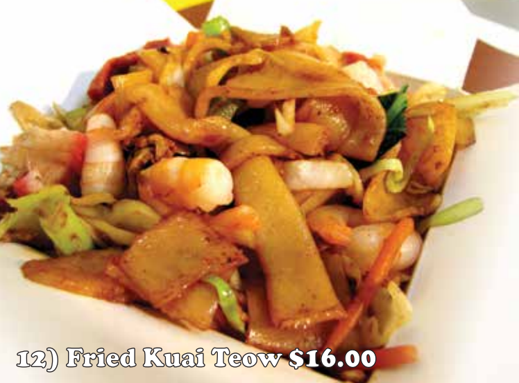
12) Fried Kuai Teow $16.00