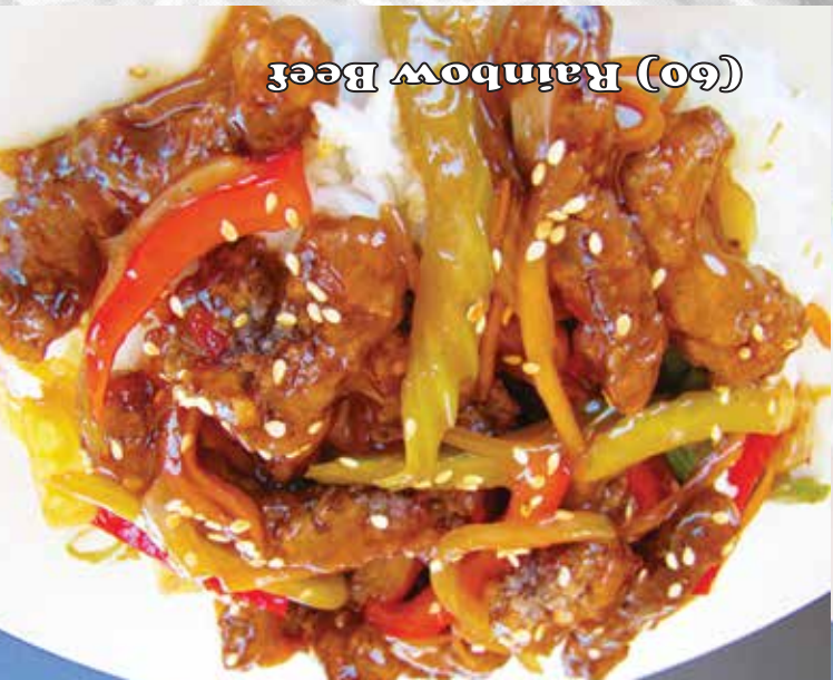
(60) Rainbow Beef

All food are consistently cooked with the least amount of oil while maintaining the original flavour.