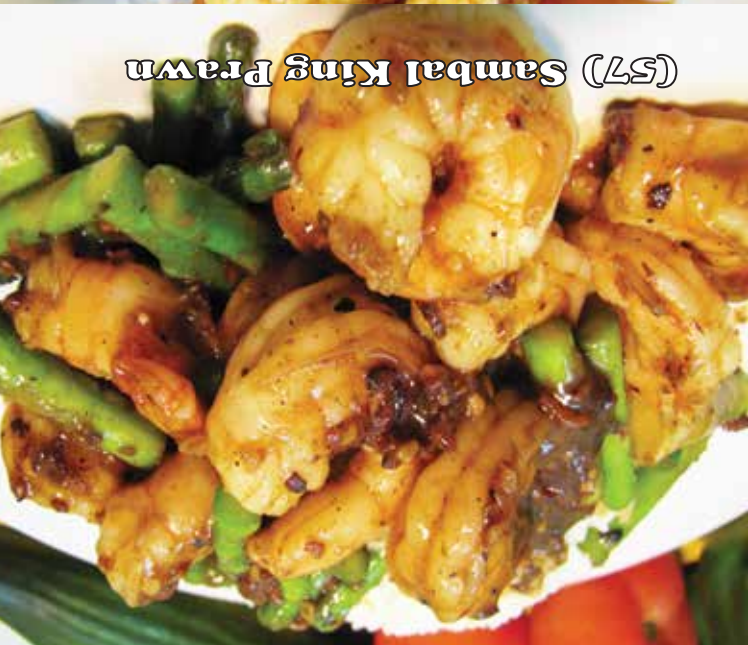
(57) Sambal King Prawn