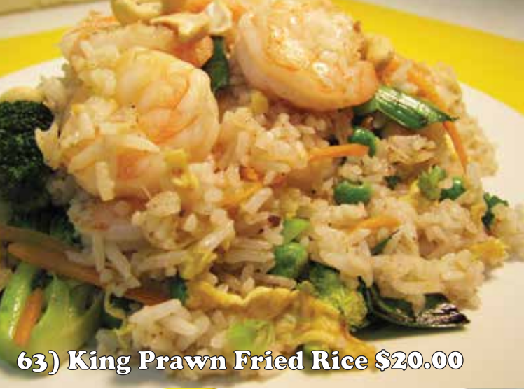
63) King Prawn Fried Rice $20.00