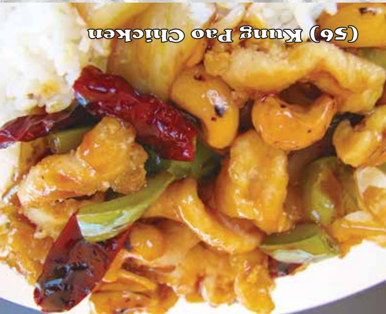
(56) Kung Pao Chicken