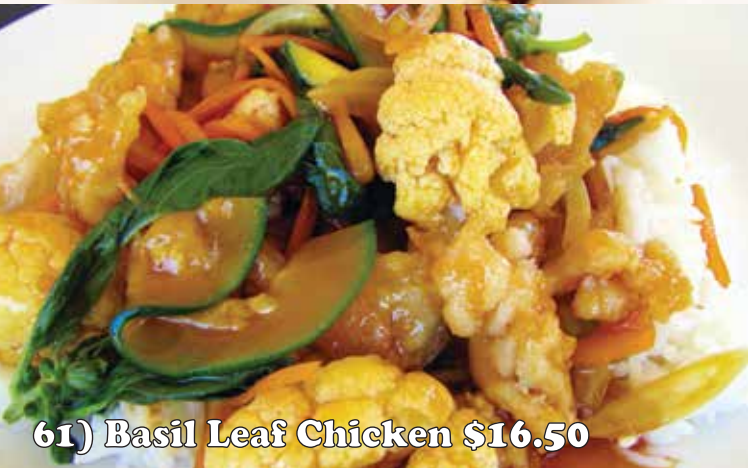
61) Basil Leaf Chicken $16.50